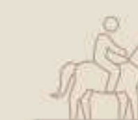
The Polo Fields